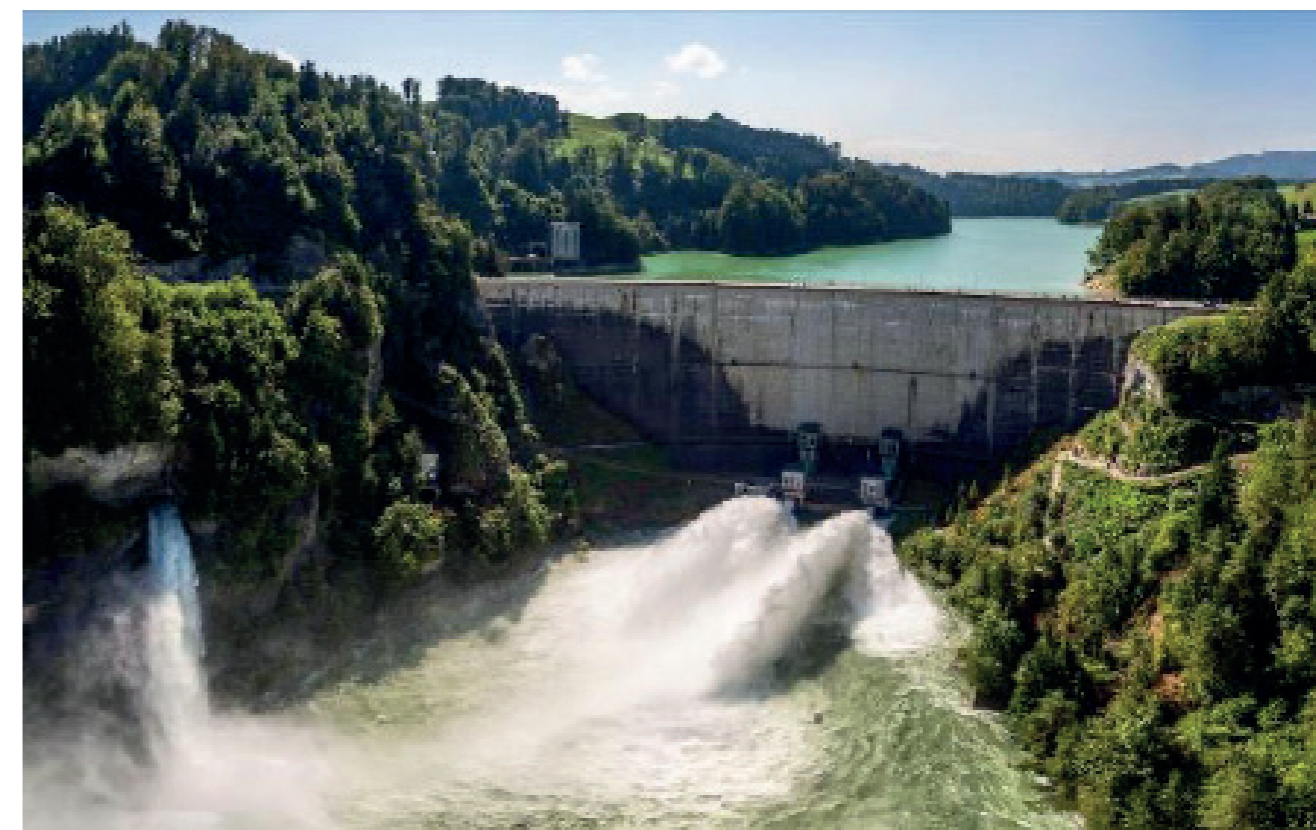
Figure 1: Artificial flood on the Sarine below the Rossens dam on 14 and 15 September 2016.

To counteract ecomorphological deficits in the Sarine floodplain between 2016 and 2022 six artificial flood events were released and monitored from the Rossens dam with maximum discharges of 161 m 3 /s (June 2016), 195 m 3 /s (Sept. 2016; Figure 1), 113 m 3 /s (Oct. 2020), 302 m 3 /s (Jul. 2021), and 75 m 3 /s (Mai 2022).